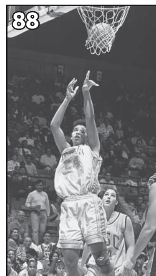
Pac-10 Athlete of the Decade Natalie Williams